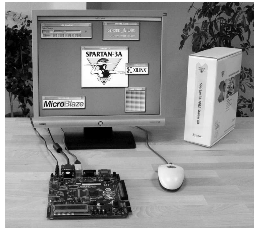
Fig. 3: The Genode FX GUI toolkit

This video input enables the use of the device in live video mixing and transformation applications.