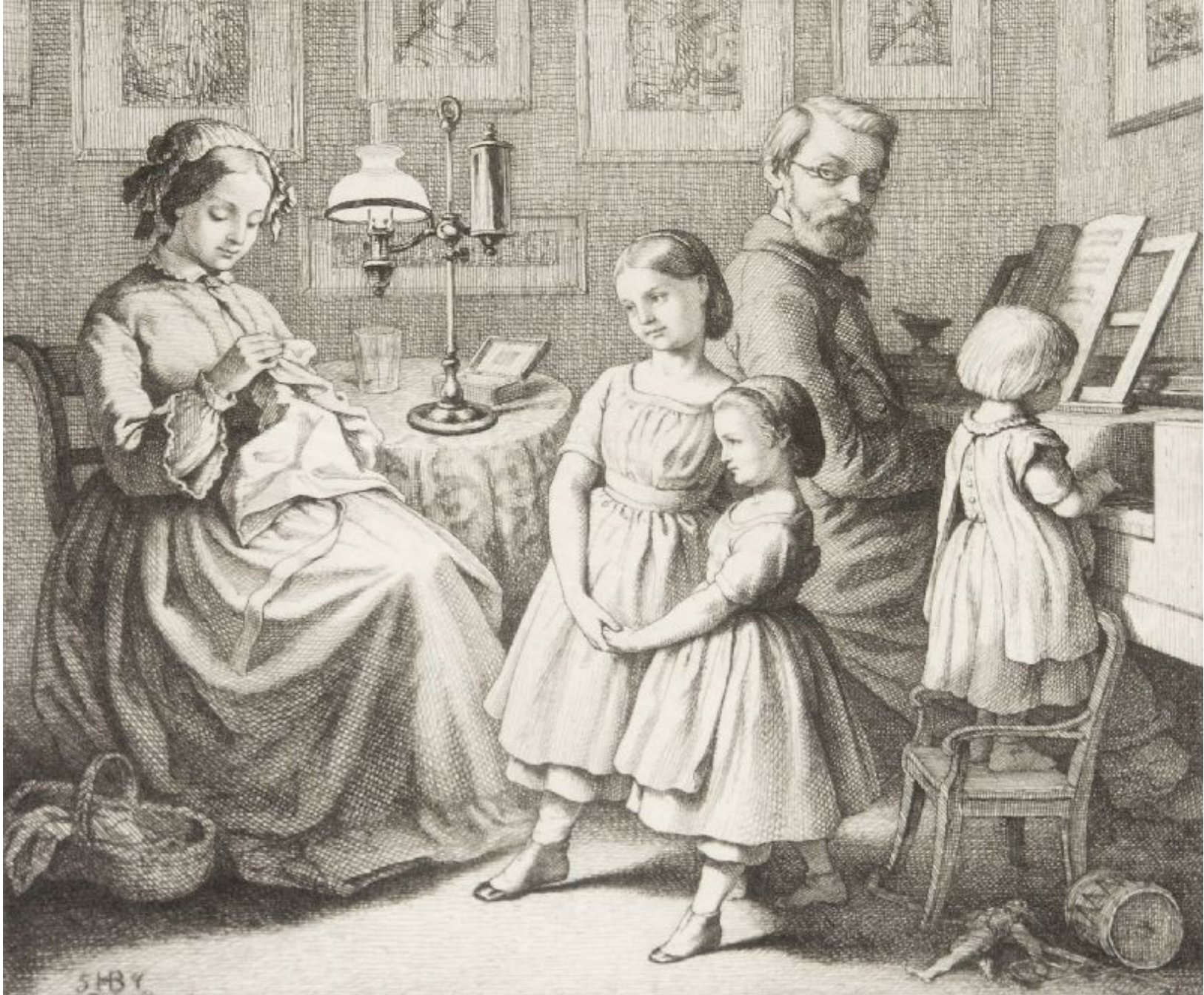
“Tanzliedchen” by Hugo Bürkner, 1854