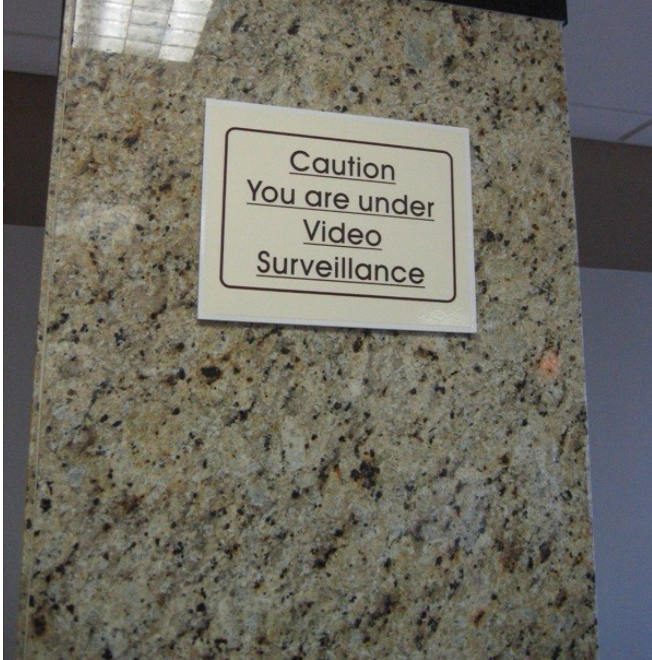
“Restaurant Surveillance Sign” by Richard Smith ( http://flickr.com/people/smith/ ) http://flickr.com/photos/smith/55403952/

License: Creative Commons 2.0 Attribution / http://creativecommons.org/licenses/by/2.0/deed.en