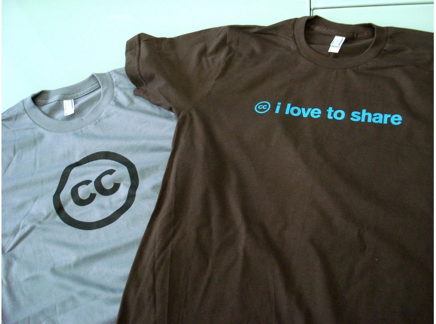
“new tshirts”