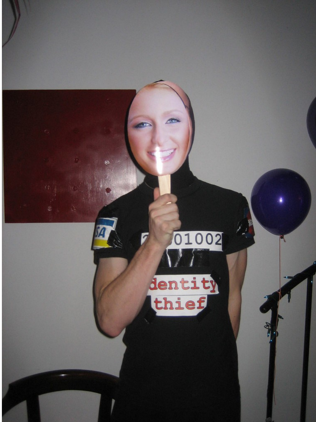
“Identity Thief as Paris” by David Goehring ( http://flickr.com/photos/carbonnyc/ ) http://flickr.com/photos/carbonnyc/57280104/in/photostream/

License: Creative Commons 2.0 Attribution / http://creativecommons.org/licenses/by/2.0/deed.en