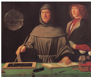
FIGURE: Portrait of Venetian Friar Luca Pacioli